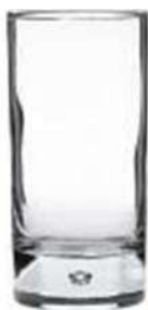
(12oz High Ball)

A replacement charge will be made for any packing cartons or sections not returned, or returned in a damp or dirty condition.